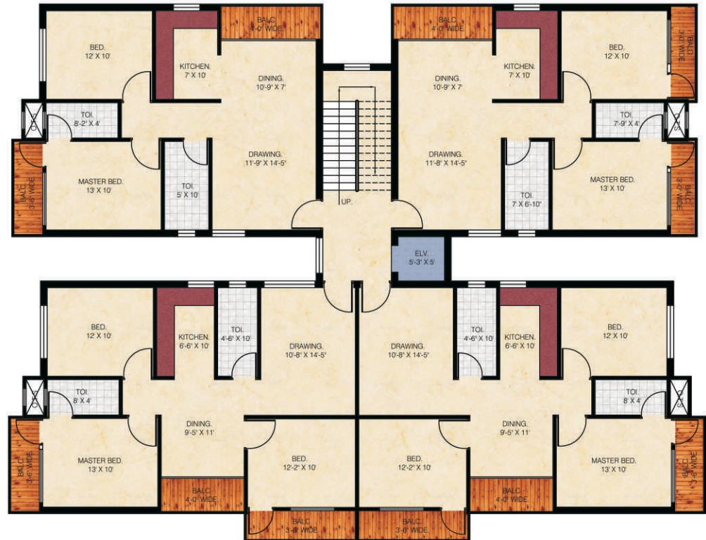
FINEST - 40 BLOCK -A