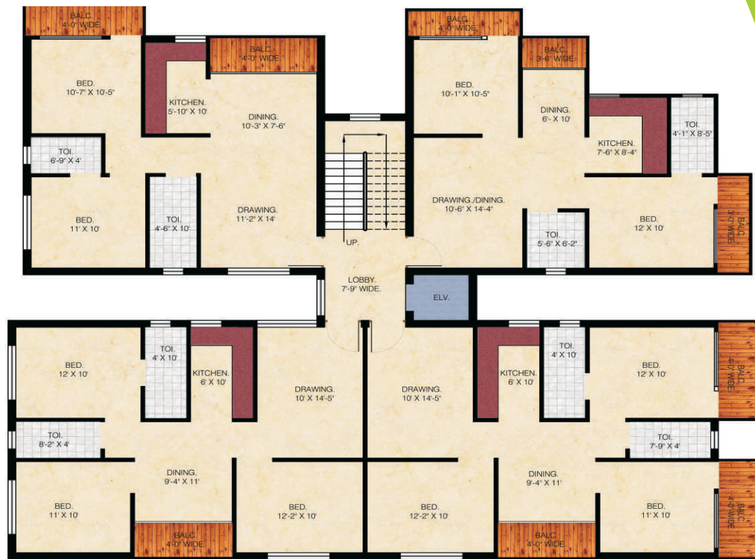
FINEST - 40 BLOCK B